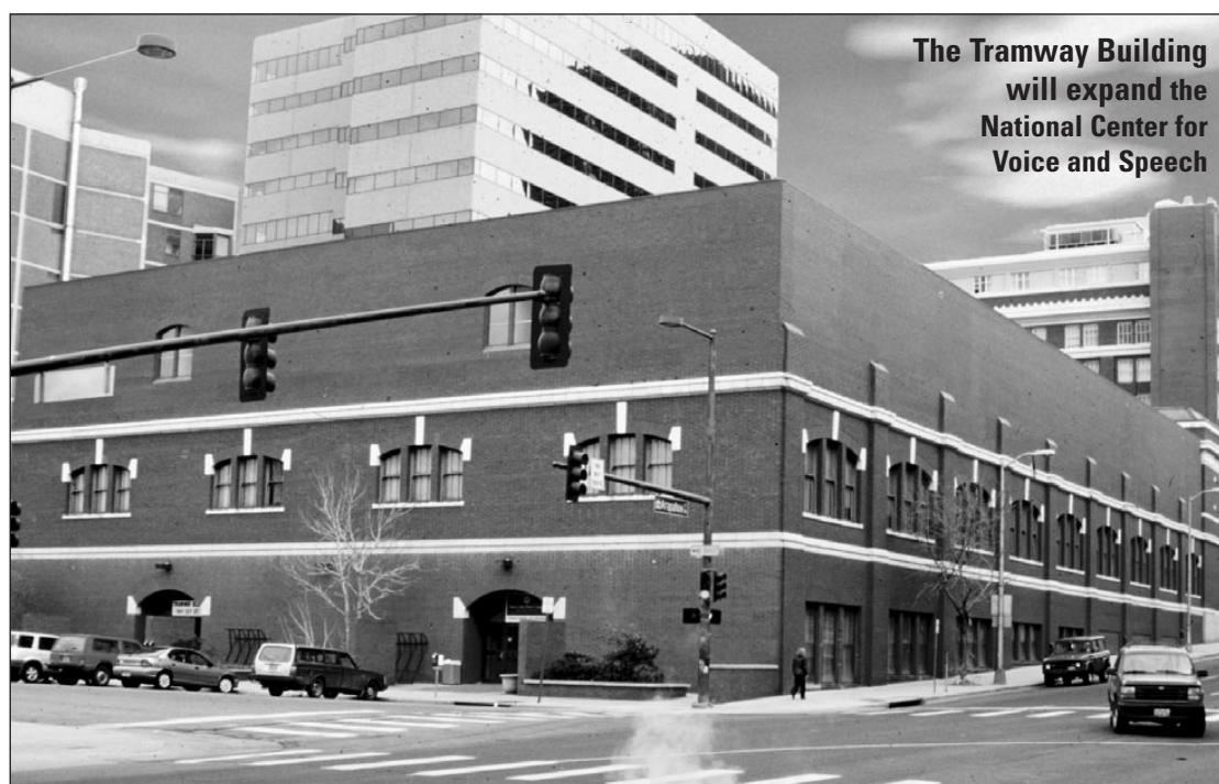
The Tramway Building will expand the National Center for Voice and Speech